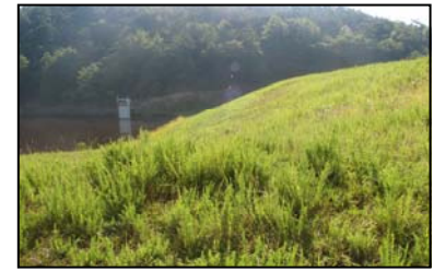
Dam #3 Summer of 2006