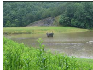
Dam #4 Flood Nov. 2006