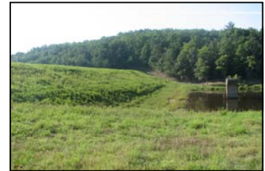
Dam #2 Summer of 2006