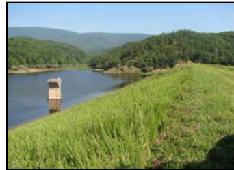
Dam #1 Summer of 2006

A Cost Share kick-off meeting was held on August 22, 2006 at the Greenfield Education Center to allow individuals to meet with local conservation partner representatives and ask questions about available programs. Light refreshments and sandwiches were served. The Commonwealth of Virginia significantly increased funding for year 2006—2007 to support the Virginia Agricultural Best Management Practices (BMP) Cost Share Program. This year a total of 14 million dollars were available, up from the 10 million from the previous year, for the 47 conservation districts across the Commonwealth due to the members of the Virginia General Assembly willing to invest in the voluntary implementation of the BMP Program.